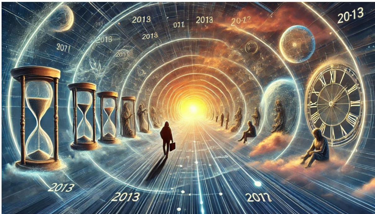
Figure 7a 'Timelines begin with every choice'

We increasingly hear the term 'Timelines', alongside 'Parallel Universes', 'Alternative Realities' and 'The Multiverse'.