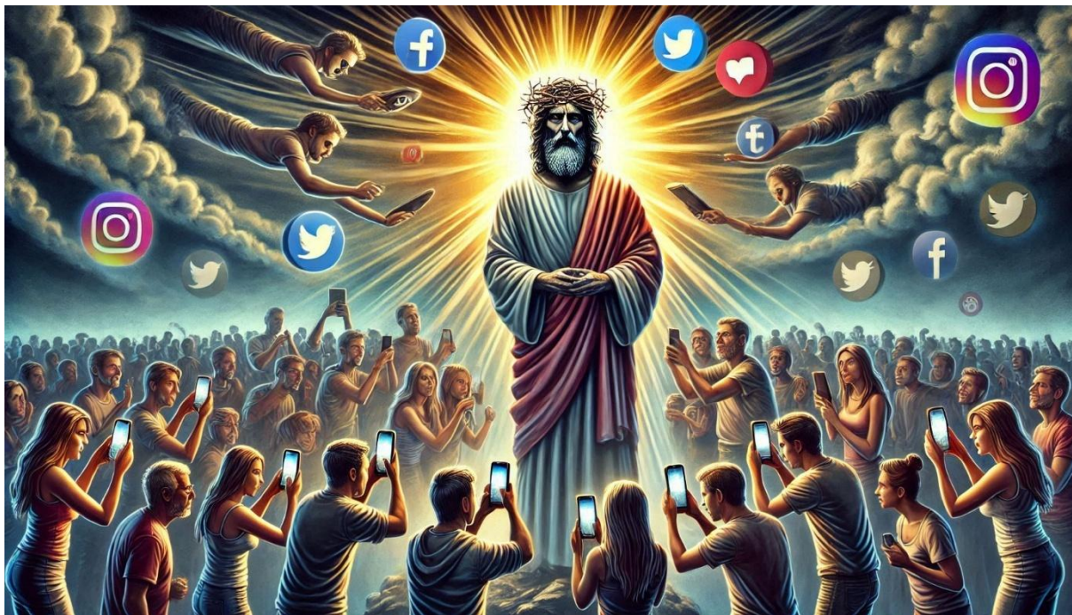
Figure 17a 'False Prophets of The Media Age'

One of the strangest elements of disquiet and disenfranchisement in the media and digital age is the expectation that many of us have when we have realised or awoken to the reality that we are not comfortable with what is happening or how we have been affected by events or the way that points of any of the scenarios or Timelines have touched our lives.