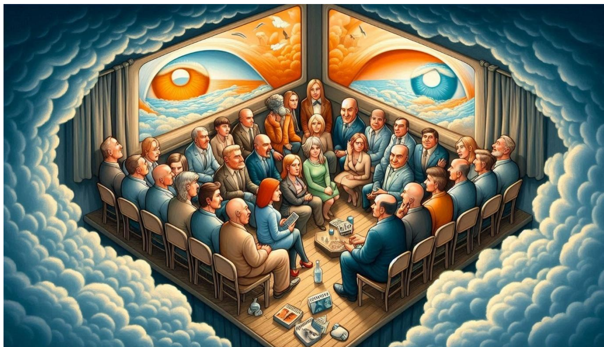
Figure 19 'Every Perspective is Different'