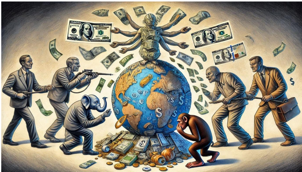
Figure 13a 'Money: The Centre of Everyone's World'

The sixth scenario is the Moneyocracy, where the adoption of Neoliberal Orthodoxy in all mainstream Economics and Economic Systems in the early 1970's has led to a complete revaluation of the benchmarks for life. Through the measurement of cost and income, money has become the centre of all things in life and the unconscious reference point that everyone uses when they make a decision about anything beyond the most trivial, or what they do in their most immediate relationships.