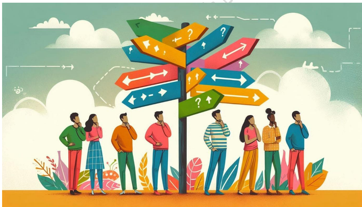
Figure 3a 'Choice'

Free will exists wherever there is genuine choice