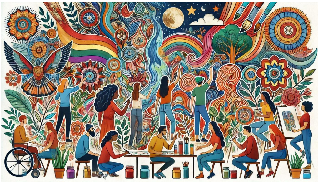
Figure 15a 'We create our own Truth'

The final scenario is whatever the reader sees, experiences and understands of the past; what is happening in their life today, and what will become the outcome of how they consider and respond to their past and present, and the action they now take to influence their future experiences in some way.