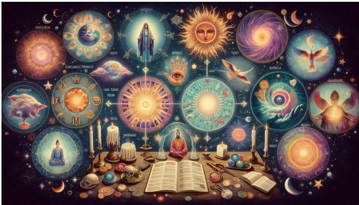
Figure 10a 'The Spiritual Pathway'

This is the scenario where people are living what they call a 'spiritual' life. Some live hermetic lives or exist 'off the grid', whilst many who remain within 'normal life' think of their spirituality as a way of defining them as being different and perhaps more aware or 'enlightened' than those who have not 'awakened' spiritually. 'Spirituality' comes in many different forms which are identifiable by the groups or tribes that follow particular doctrines and often wear them like a badge or stripes. No matter the medium that 'spiritual people' are aligned with, they often consider themselves to have better understanding of the workings of the world and why the world works in the way that it does. Their spirituality may define them as being closer to God, Source, spirit, nature, the environment, the planet or any one of a number of powers or entities that are present but indefinable and invisible to those who 'cannot see'.