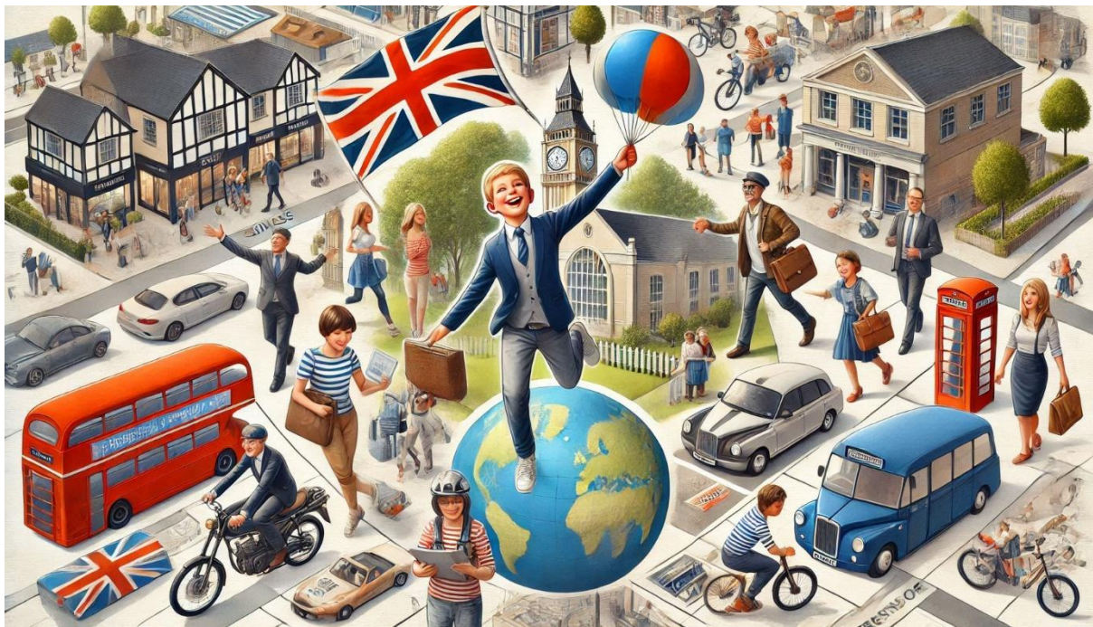
Figure 8a 'Normality'

This is the scenario or timeline that will be familiar to many.