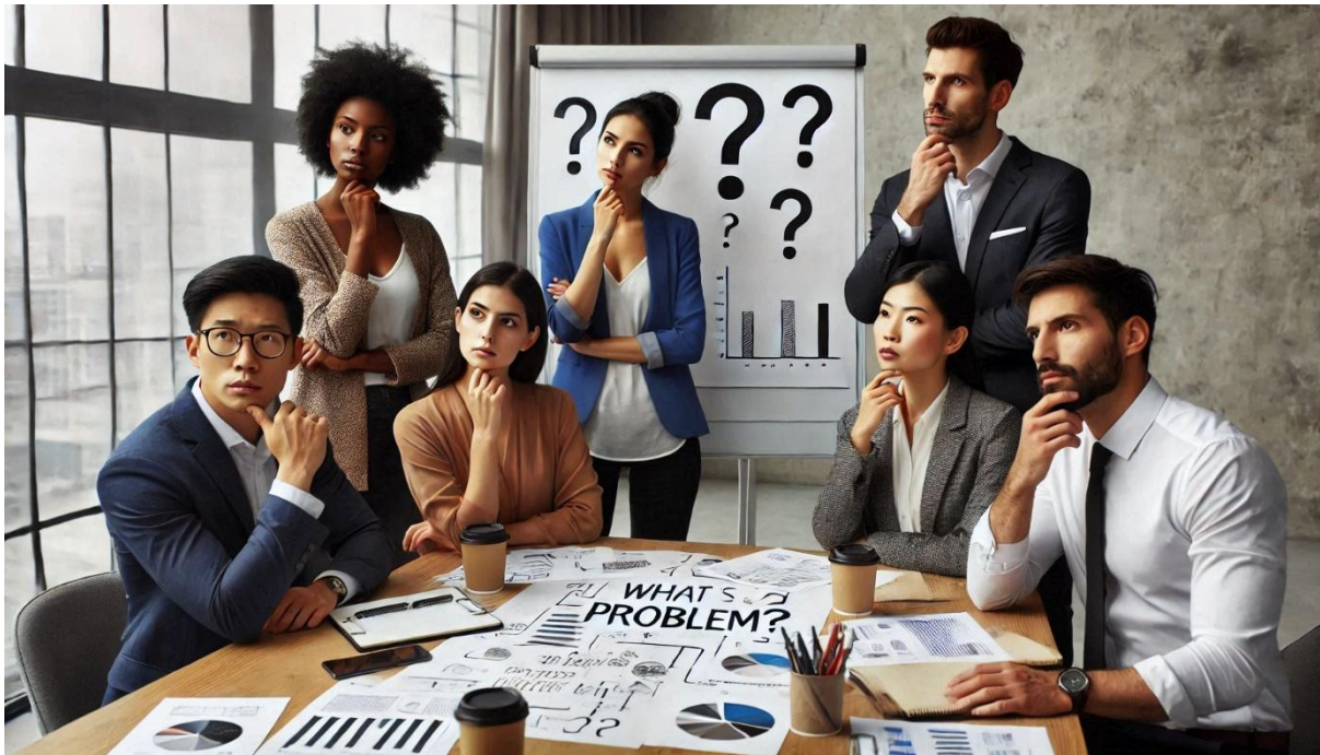
Figure 4a 'The Problem isn't The Problem'