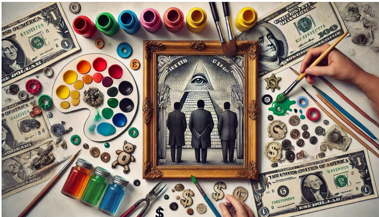
Figure 9a 'Reach of The New World Order'

The second scenario or timeline is the New World Order, conspiracy theory, elites takeover, illuminati, secret society view, where organisations such as the World Economic Forum (WEF), the World Health Organisation (WHO) and the United Nations (UN) are in the final stages of creating a 'World Government'. National Boundaries and Governments cease to exist, and we are heading into a dystopian nightmare where the majority of us have no value and everything in the world revolves around 'The Few'.