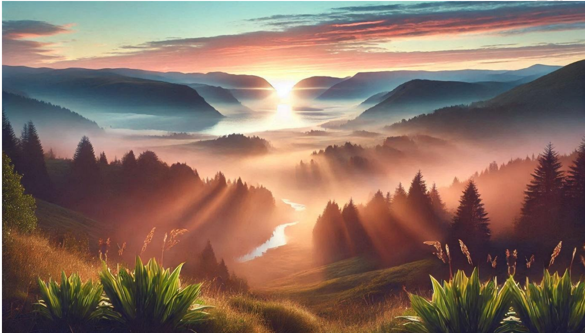
Figure 5a 'We cannot see what we aren't ready to see'

We cannot see what we cannot see until the time we are ready to see it