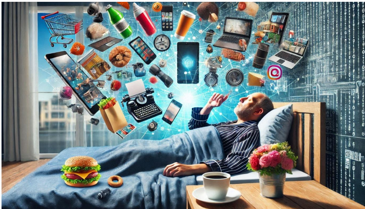
Figure 12a 'The Consumerist Dream'

The third scenario is the consumerist dream, where everything that we could possibly want has been made available to us all at the touch of a button, providing we have a credit score and measurable background that means we 'qualify' as being creditworthy and can pay the value of loans, credit cards, point of sale finance, leasing and buy now pay later arrangements and more importantly the interest that they attract, back to the credit provider, as agreed.