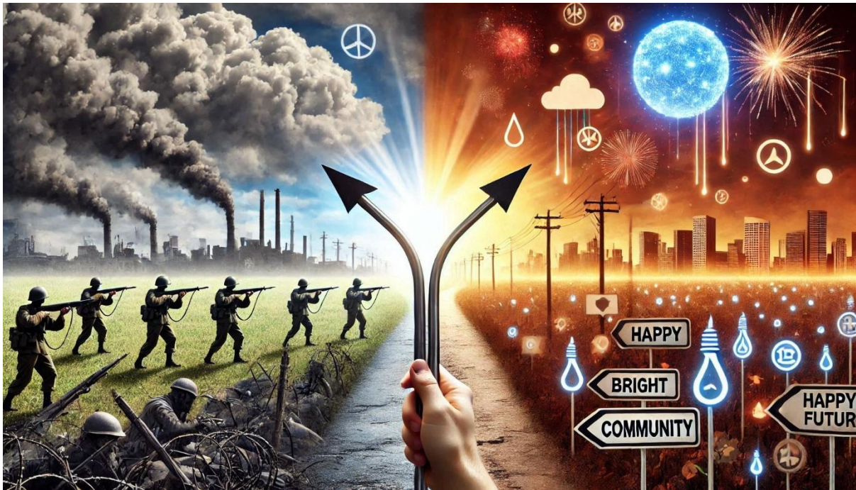
Figure 16 'Inevitable Risk & No Way Back'