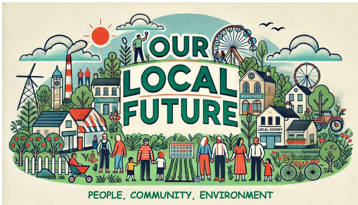
Figure 14a 'Our Local Future'

The seventh scenario is being of it but not within it. Understanding and accepting that what you are experiencing is the way that the world now works, whilst being mindful and conscious of all the thing that you have to do and say each and every day, just to keep playing along with a game where you can see that there is only one direction and within that, everything that is happening means that every crisis just leads to another and everything is now going wrong.