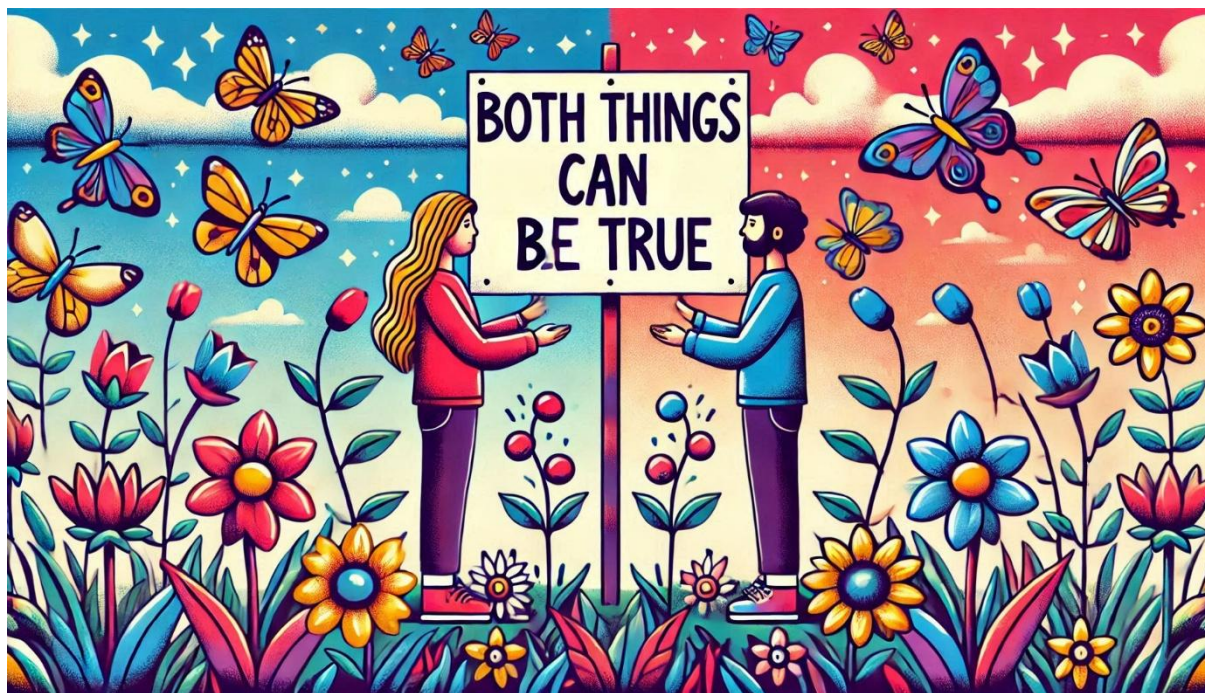
Figure 18a 'Both Things Can Be True'

This is where things begin to get a little bizarre and more difficult to think about. Because we have a tendency to believe that only one version of events can ever be true.